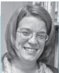
At first I panicked that he might find me. Now God is taking my fear away Pg. 3