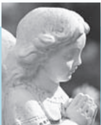
In Memory of In Honor of Pg. 4